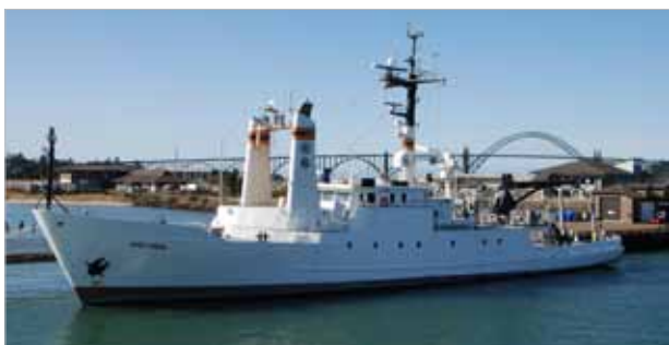
The R/V Wecoma was honored for over 35 years of service to Oregon State University in a retirement ceremony on March 23rd. OSU and community leaders, current and former captains and crew, and some of the many scientists who sailed with her attended the ceremony on the dock at the HMSC campus.

OSU acquired the Oceanus via the University National Oceanographic Laboratory System (UNOLS), a consortium of 60 academic research institutions that operate 16 vessels around the country. OSU, a member of UNOLS, was retiring its venerable research vessel, R/V Wecoma (see photo) and looked to the consortium for a replacement. Although the two vessels are about the same age, a National Science Foundation rapid assessment determined that the Oceanus would be more cost-effective to operate for the next 5-10 years. By that time, OSU hopes to have a new ship.