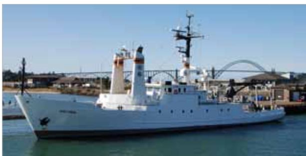
The R/V Wecoma was honored for over 35 years of service to Oregon State University in a retirement ceremony on March 23rd. OSU and community leaders, current and former captains and crew, and some of the many scientists who sailed with her attended the ceremony on the dock at the HMSC campus.

OSU acquired the Oceanus via the University National Oceanographic Laboratory System (UNOLS), a consortium of 60 academic research institutions that operate 16 vessels around the country. OSU, a member of UNOLS, was retiring its venerable research vessel, R/V Wecoma (see photo) and looked to the consortium for a replacement. Although the two vessels are about the same age, a National Science Foundation rapid assessment determined that the Oceanus would be more cost-effective to operate for the next 5-10 years. By that time, OSU hopes to have a new ship.