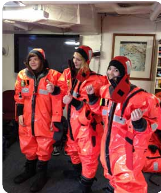
Photo: 8th graders from Toledo toured one of the NOAA ships and tried on survival suits

With support from a generous donor, Oregon Sea Grant hosted two “Careers in Science Investigation” programs in January for Lincoln County middle school students. Over 120 seventh and eighth graders from Eddyville, Toledo, and Waldport participated in hands-on marine science activities at HMSC. Students interacted with staff from Oregon Department of Fish and Wildlife, NOAA and OSU as they conducted adult steelhead dissections, collected data on ghost and mud shrimp, and went on a tour of a research vessel. The goal of these programs is educate students on local employment opportunities and stimulate interest in pursuing a career in science.