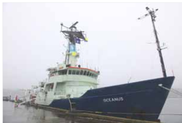
The R/V Oceanus at the pier in her new homeport of Newport, Oregon. Visit her on the webcam at: http://webcam.oregonstate.edu/oceanus/