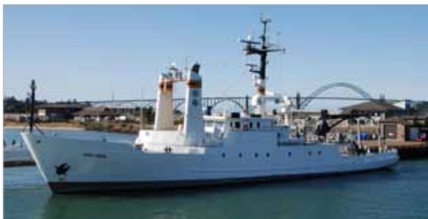
The R/V Wecoma was honored for over 35 years of service to Oregon State University in a retirement ceremony on March 23rd. OSU and community leaders, current and former captains and crew, and some of the many scientists who sailed with her attended the ceremony on the dock at the HMSC campus.

OSU acquired the Oceanus via the University National Oceanographic Laboratory System (UNOLS), a consortium of 60 academic research institutions that operate 16 vessels around the country. OSU, a member of UNOLS, was retiring its venerable research vessel, R/V Wecoma (see photo) and looked to the consortium for a replacement. Although the two vessels are about the same age, a National Science Foundation rapid assessment determined that the Oceanus would be more cost-effective to operate for the next 5-10 years. By that time, OSU hopes to have a new ship.