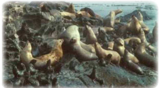
The Rogue Reef Unit of Oregon Islands NWR hosts the largest breeding area for threatened Steller sea Lions in U.S. Water south of Alaska.

The Service celebrated several milestones on the coast in 2011. Service staff and community volunteers planted over 13,500 plants on the central coast for Oregon silverspot butterfly. A Habitat Conservation plan for plovers was approved, providing protection for the birds and their nesting habitat and regulatory certainty for beach users. And for the first time since listing, the snowy plover broke every record and met all recovery goals in Oregon.