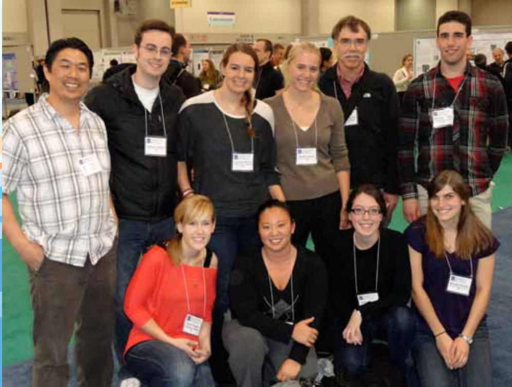
Photo: This year's Ocean Sciences meeting in Salt Lake City, UT was not only an exciting one, but also one filled with OSU and HMSC representation!