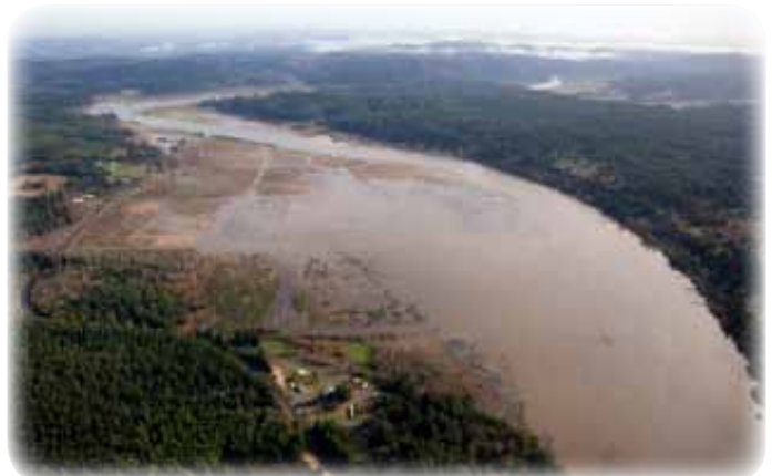
High tide aerial view looking east of the recently completed Ni-les'tun Tidal Marsh Restoration Project on Bandon Marsh NWR.