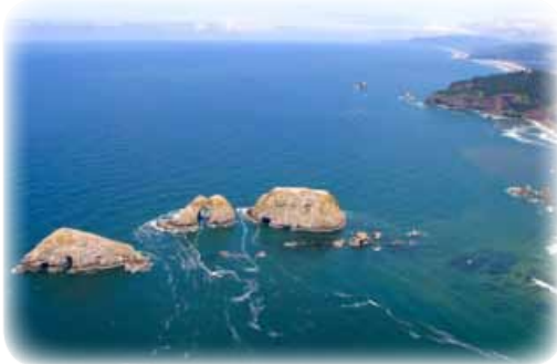
Aerial view looking north showing Three Arch Rocks NWR left center, Cape Meares NWR in the upper right and rocks within Oregon Islands NWR along the right side.

Marsh, Cape Meares, Nestucca Bay, Oregon Islands, Siletz Bay and Three Arch Rocks, spanning 320 miles of rugged coastline. Diverse wildlife habitats include coastal rocks, reefs and islands supporting large seabird colonies and pinniped haulouts and rookeries, old-growth forest, and highly productive tidal marshes and estuaries. USFWS staff reach out to the coastal community in many ways including the Shorebird Sister Schools Program which introduces grade school students to these long-distance migrants and the importance of Oregon's estuarine habitats to their survival.