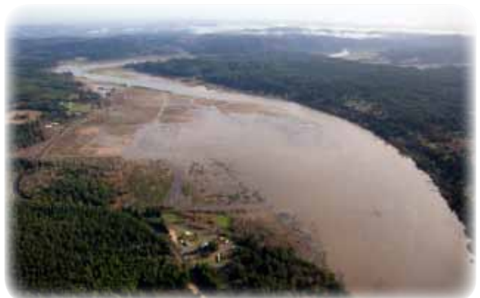
High tide aerial view looking east of the recently completed Ni-les'tun Tidal Marsh Restoration Project on Bandon Marsh NWR.