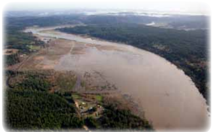
High tide aerial view looking east of the recently completed Ni-les'tun Tidal Marsh Restoration Project on Bandon Marsh NWR.