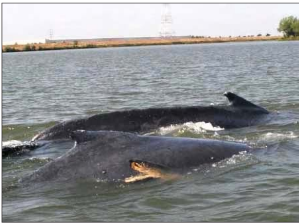
Humpback mother and calf pair, "Delta" and "Dawn", surfacing in the Sacramento River. Photo (courtesy California Department of Fish & Game) reveals an injury of unknown cause near the dorsal fin of one

A fragment of the maternally inherited mitochondrial control region was sequenced and compared to a dataset of approximately 1300 samples previously collected from across the North Pacific as part of the Structure of Populations, Levels