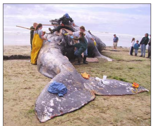
Jim Rice and Marine Mammal Stranding Network volunteers collect tissue samples from the beached whale that washed ashore near Seal Rock.

of marine mammals were represented in these responses; 56 animals were sampled; 44 animals were necropsied; and two taken to the Oregon Coast Aquarium for rehabilitation.